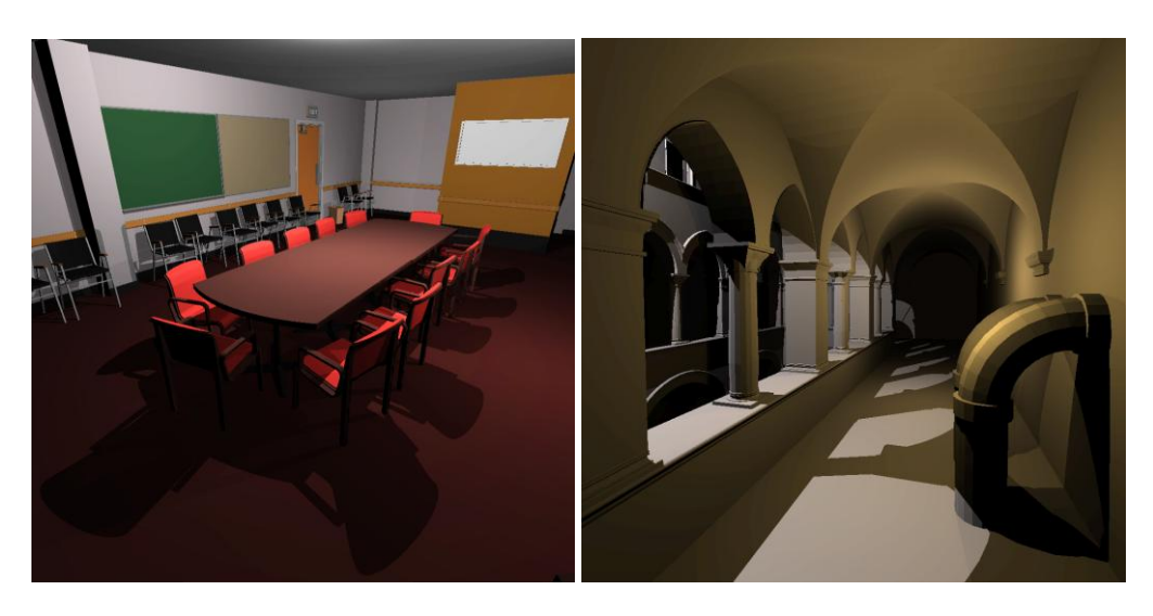
Figure 1: Example images rendered using RTfact at a 1024x1024 resolution on a mobile single core of a 2.6 GHz Core 2 Dual processor at 8.2 and 7.1 fps.

The new ray tracing engine "RTfact" (Georgiev, 2008) has the goal to provide a maximum performance on the latest generation of CPUs and GPUs without compromising flexibility.